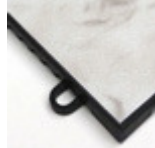
Luxury White Marble